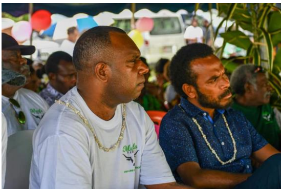
Members of the Committee

Below are some of the photos taken on this field trip: